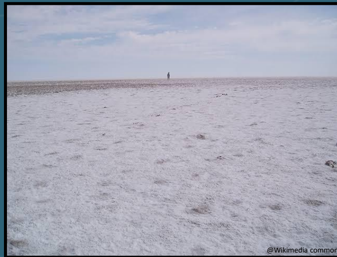
Salted crust of Lake Eyre